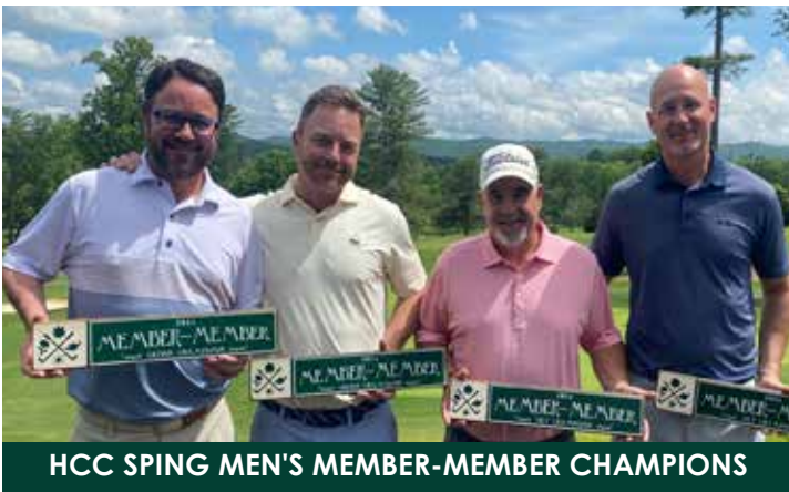
HCC SPRING MEN'S MEMBER-MEMBER CHAMPIONS